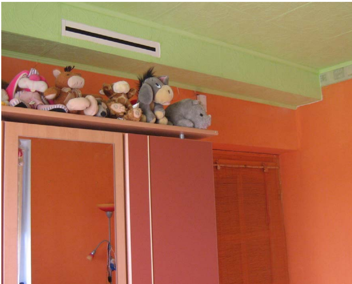
residential building, Szazhalombatta (Hungary)

Ferdinand Schad KG Steigstraße 25 – 27 D-78 600 Kolbingen (Zweigniederlassung)