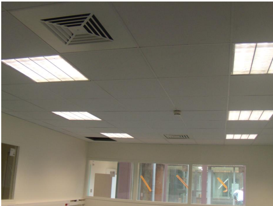
Hospital, Vichy (France)