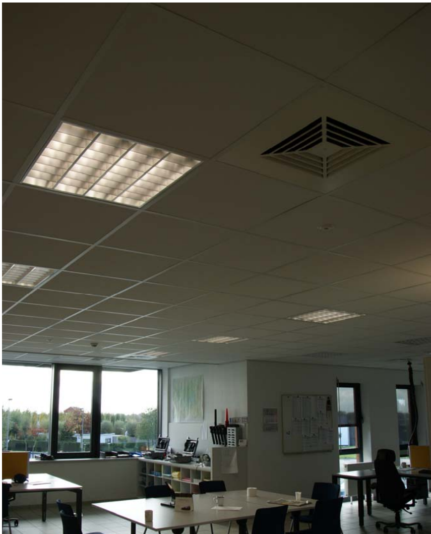
Politiekantoor, Ieper (BEL)