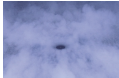
Smoke test PIL-B-R