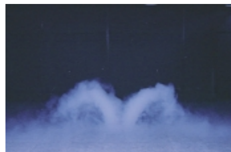
Smoke test PIL-B-Q