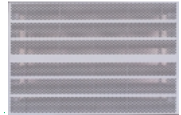
PIL-B version for in-line mounting